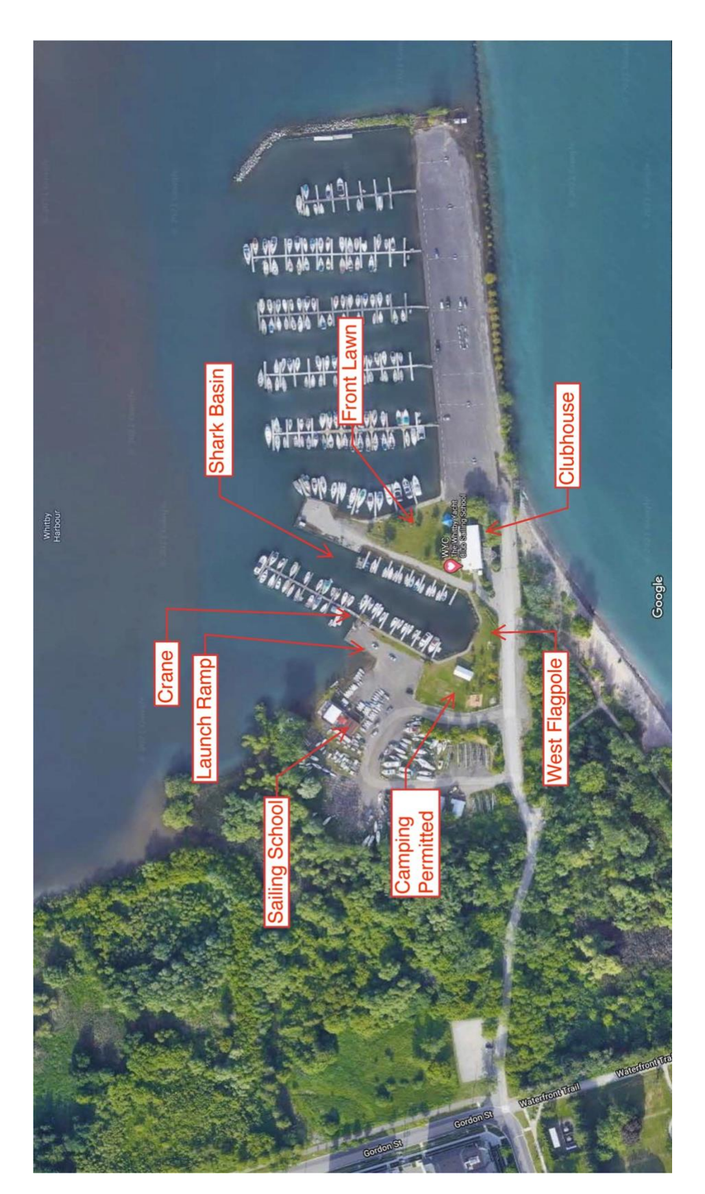
Addendum A - Event Venue