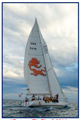
Dragon Fly Plus" 2014 PHRF and Committee Trophy winner.