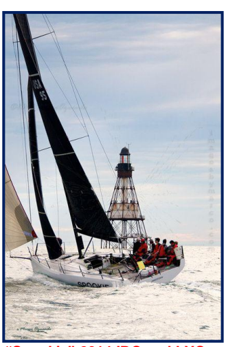
Spookie" 2014 IRC and L Trophy winner.