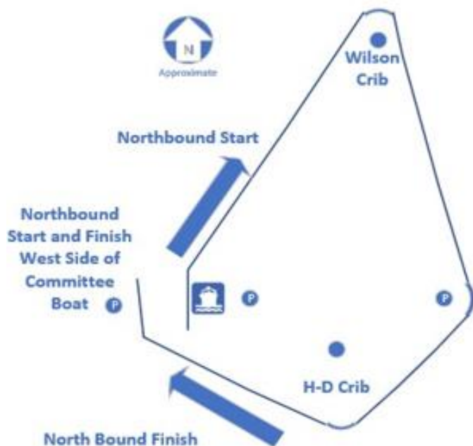
Figure 3: North route - B