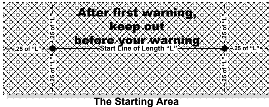
Diagram 1 The Starting Area

After the first warning signal for a race and prior to her warning signal, a sailboat shall keep clear of the starting area that extends one-quarter of the length of the starting line ahead of and behind the starting line. It shall also extend one-quarter of the length of the starting line past either end of the starting line