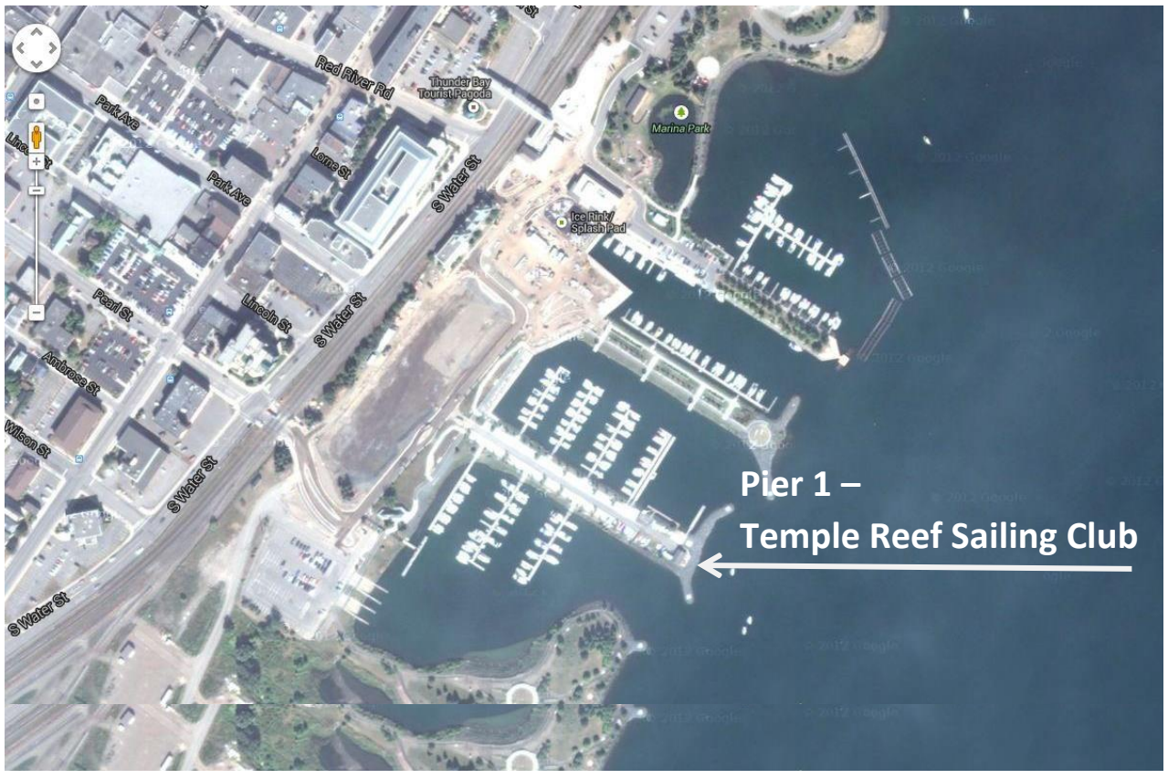
Dia.1. Prince Arthur's Landing at Marina Park. Thunder Bay Ontario, Canada