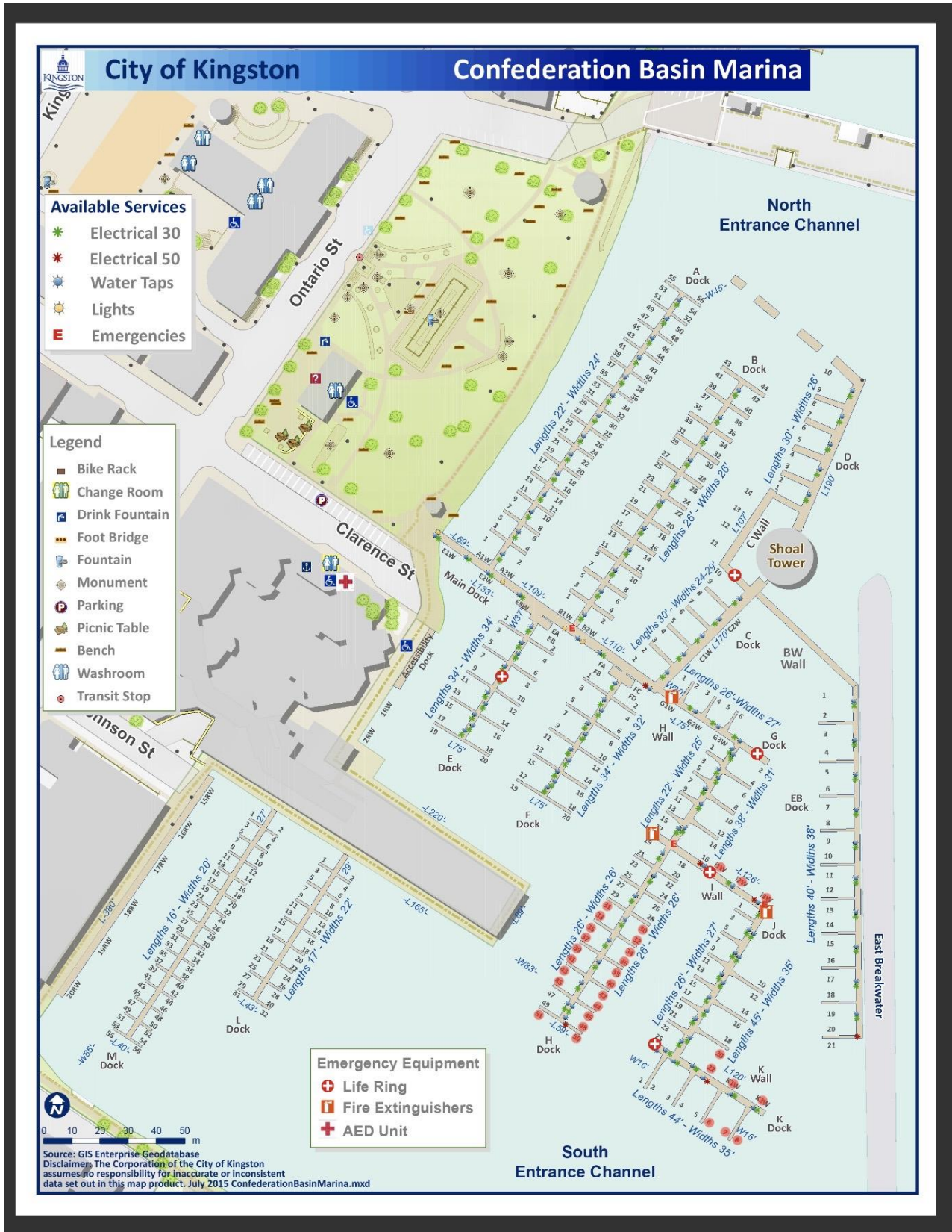
Diagram 2 Confederation Basin Marina Map