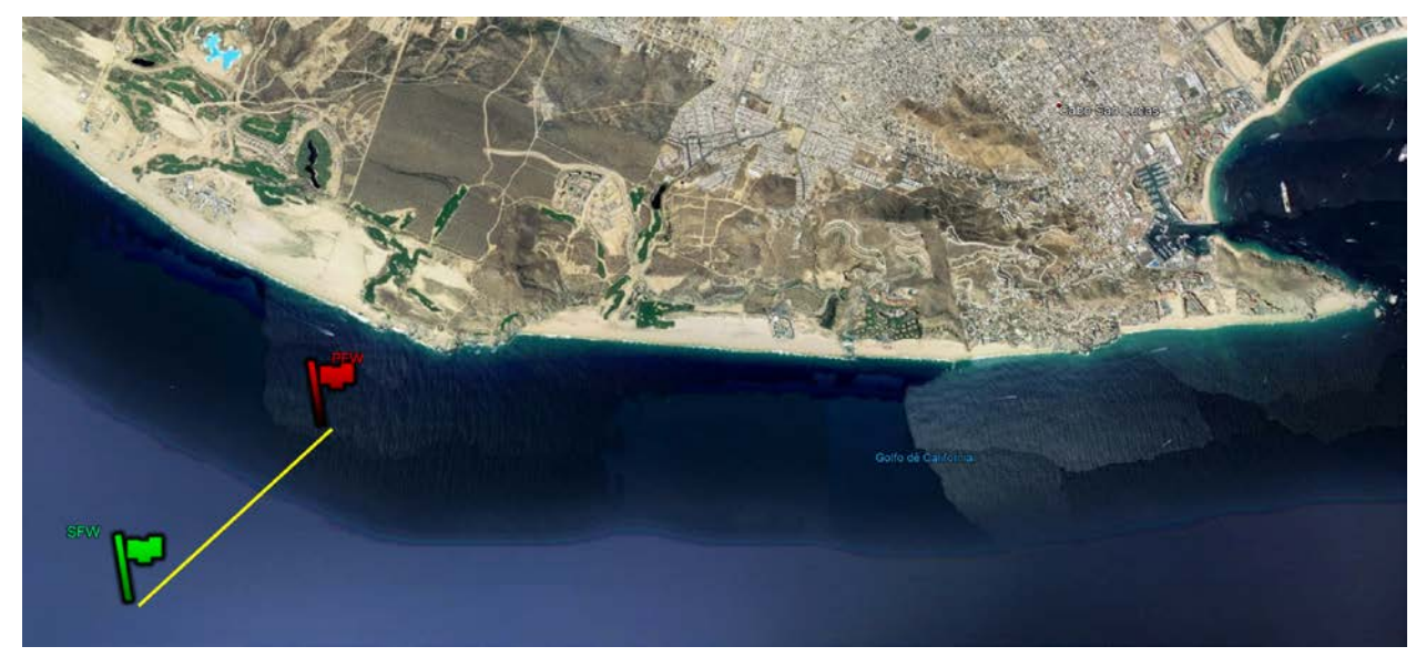
Finish Line with SFW and PFW shown in proximity to Cabo Falso