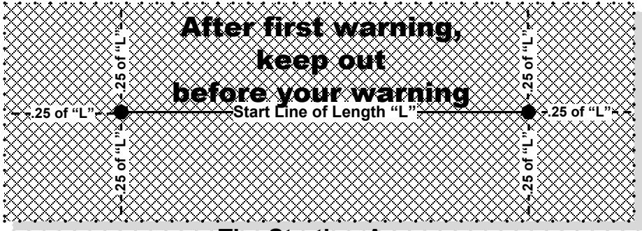
The Starting Area

After the first warning signal for a race and prior to her warning signal, a sailboat shall keep clear of the starting area that extends one-quarter of the length of the starting line ahead of and behind the starting line. It shall also extend one-quarter of the length of the starting line past either end of the starting line