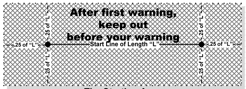
Diagram 1 The Starting Area