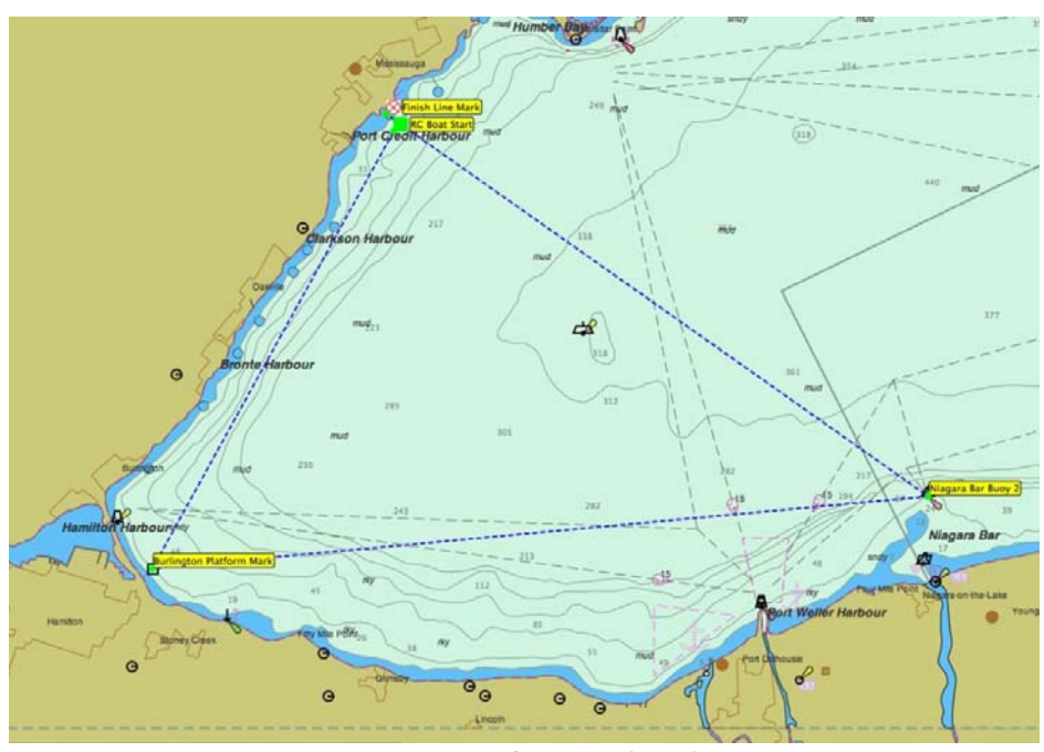
Not be used for navigation