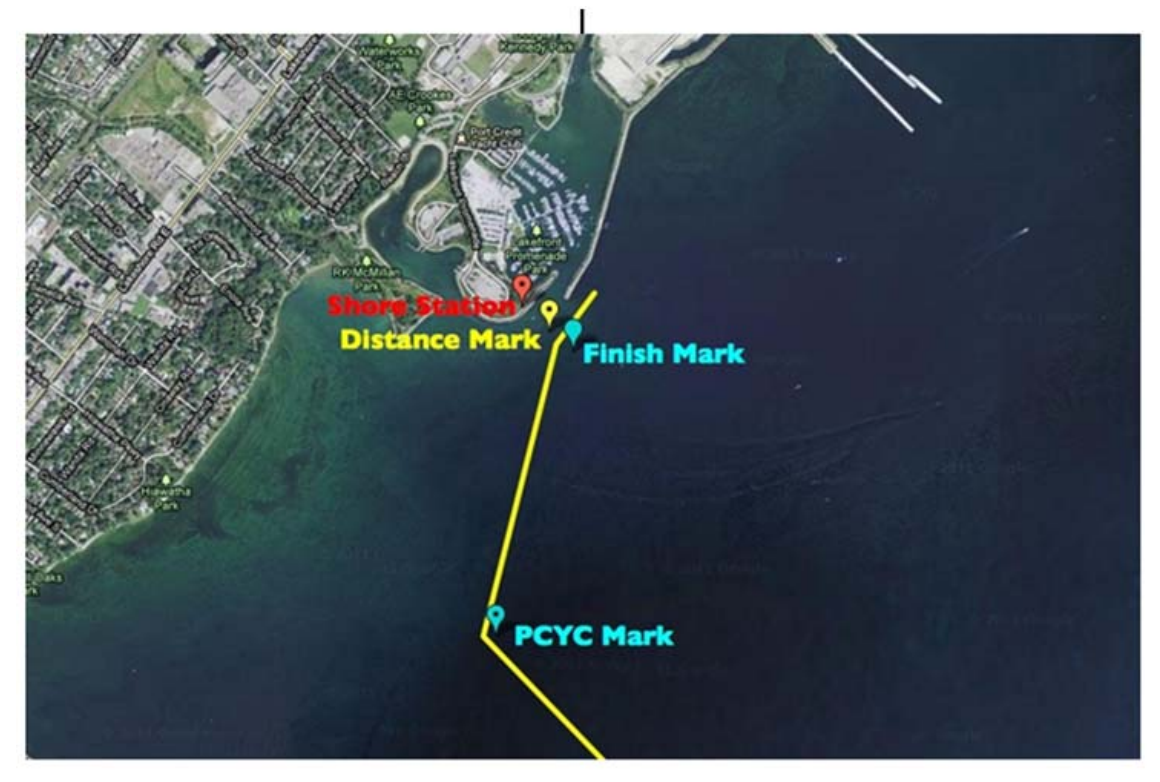
Diagram 2 The Finish

After the first warning signal for a race and prior to her warning signal, a sailboat shall keep clear of the starting area that extends one-quarter of the length of the starting line ahead of and behind the starting line. It shall also extend one-quarter of the length of the starting line past either end of the starting line