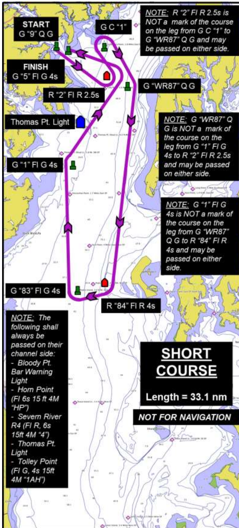
Figure 3. SHORT COURSE