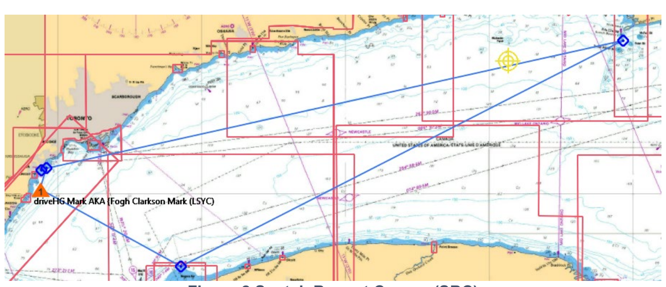
Figure 2 Scotch Bonnet Course (SBC)