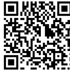
Getting Back from the HOOK