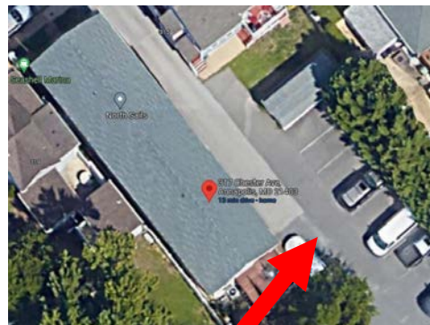
Drop Box Location