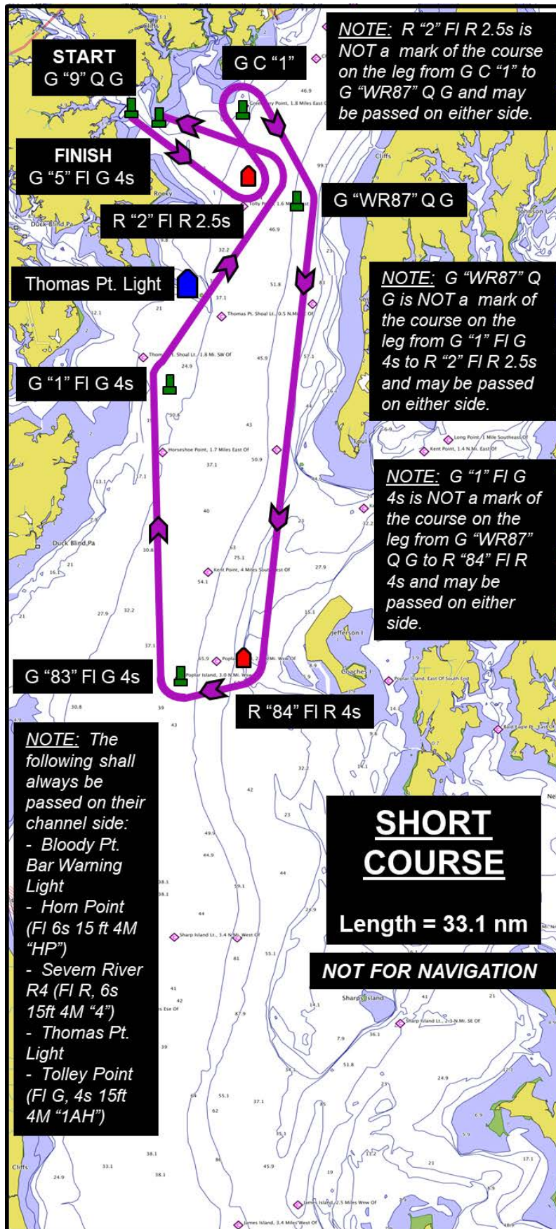
Figure 3. SHORT COURSE