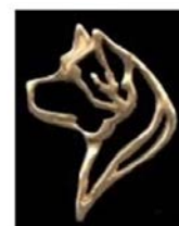
IGM&B Holdingr. Inc. (301) 331-8529