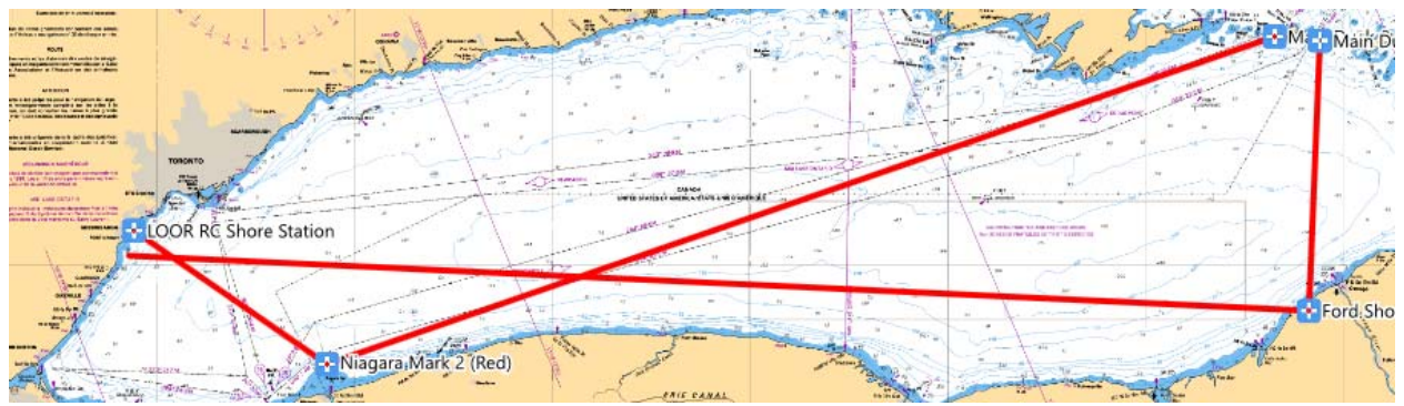
Not be used for navigation