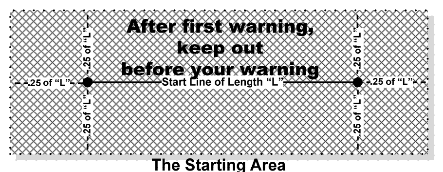
After the first warning signal for a race and prior to her warning signal, a sailboat shall keep clear of the starting area that extends one-quarter of the length of the starting line ahead of and behind the starting line. It shall also extend one-quarter of the length of the starting line past either end of the starting line